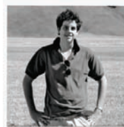
BLESSED CARLO ACUTIS

2. The OCTOBER Food of the Month donation is FAMILY-SIZED PEANUT BUTTER . Please drop off donations at the main entrance of the Church or at the Parish Office.