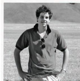
BLESSED CARLO ACUTIS

12:10 PM: Mass 1:00 PM: Holy Hour 2:00 PM: Veneration 7:00 PM: Solemn Mass for All Saints 8:00 PM: Reflection 10:00 PM: End