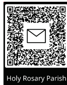
Holy Rosary Parish