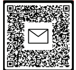
Holy Rosary Parish

Learn: how to avoid problems: in your Will, with the Powers of Attorney through proper Estate Trustee selection and how to create your personal Catholic legacy.