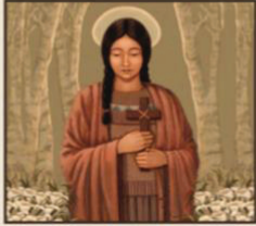
St. Kateri Tekakwitha Lily of the Mohawks