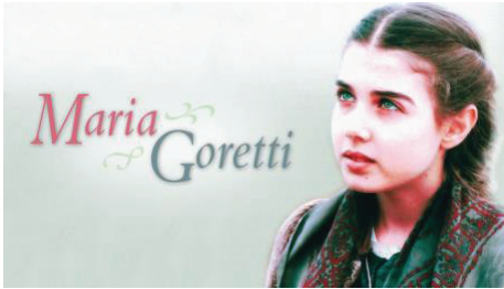
Maria Goretti: The Story of the Patroness of Modern Youth

“As for me, in justice I shall behold your face; I shall be filled with the vision of your glory.” (Cf. Psalm 16.15)